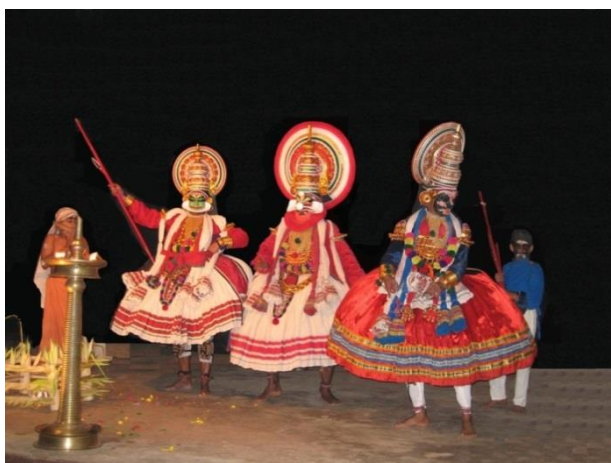
A scene from the Hindu epic story Daksha Yaga

The Kala Chethena Kathakali Company is one of the world's foremost Indian theatre companies. Many of our children have been learning about Hinduism in RE this term and Kathakali is the classical dance drama of Kerala, originating in the Hindu temples 500 hundred years ago to bring the Hindu epic stories to the local people through storytelling. The company presents breathtaking performances supported by workshops led by top international artists. This is a rare opportunity to experience non-western theatre and culture.